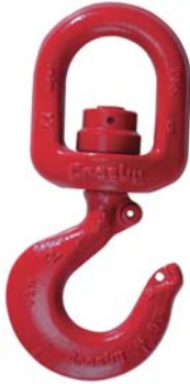
Suitable for frequent rotation under load.